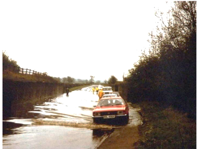
Photo 2:- A45 Flooded by Canal water off fields to East of Road (Old Station Bridge)